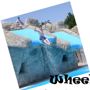
Wheeling Water Park