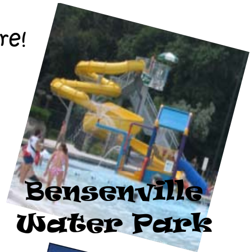
Bensenville Water Park